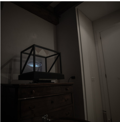
Wunderkammern - Envy Credit: © David Cotterrell (2024)