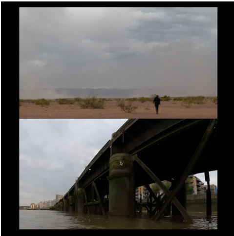
Video Still from Over/Under version of work