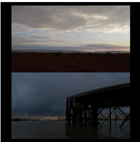
Video Still from Over/Under version of work