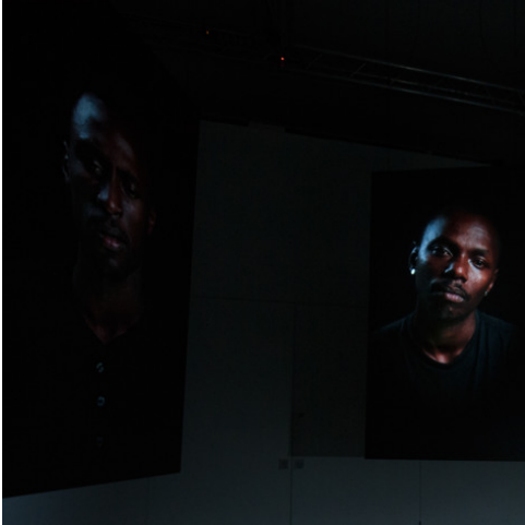
Installation view at Deptford X, London Credit: © David Cotterrell (2018)