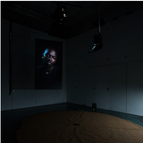
Installation view at Deptford X, London Credit: © David Cotterrell (2018)