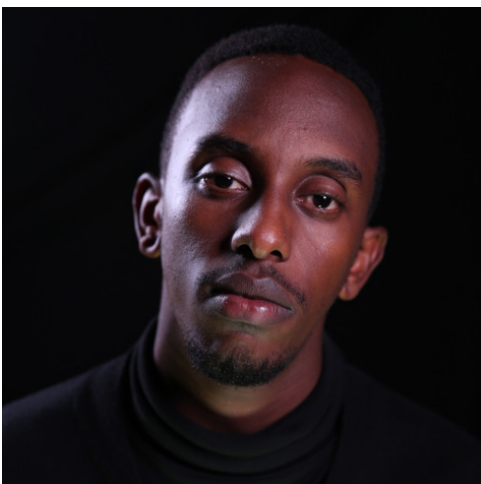
Video Still from Mirror IV : Legacy (2018)