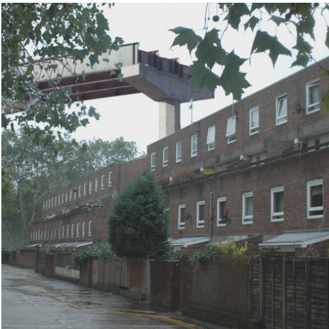
A photomontage view of one of the piers. Credit: David Cotterrell (2006)

The full proposal may be downloaded as a PDFdocument here .