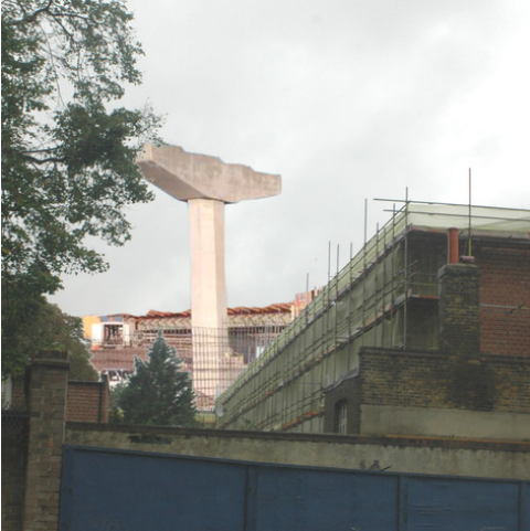
A photomontage view of one of the piers. Credit: David Cotterrell (2006)