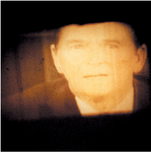
Super8 Loop of Reagan's StarWars Presentation