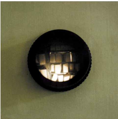
Corridor view of barricaded room