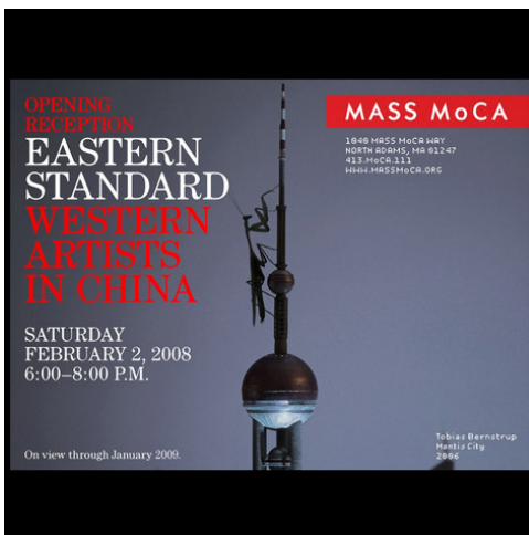
Exhibition Publicity Credit: Tobias Bernstrup (2008)