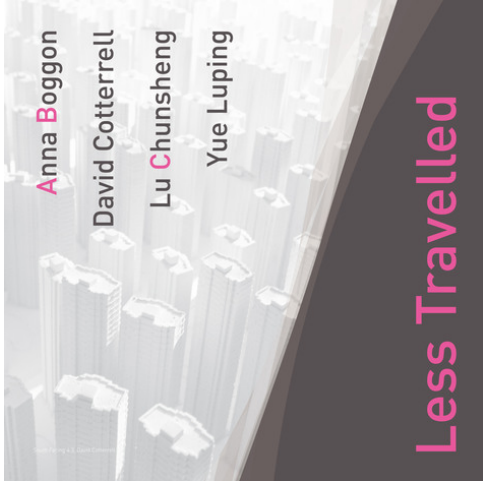
Exhibition Invite Credit: David Cotterrell