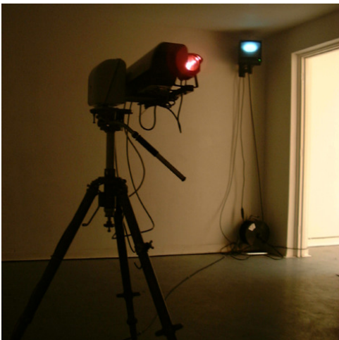
Camera and Infra-red Light Credit: David Cotterrell (2001)