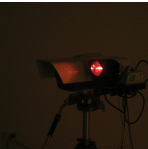
Low-Light