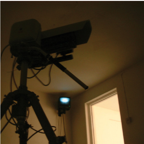
Camera and Monitor