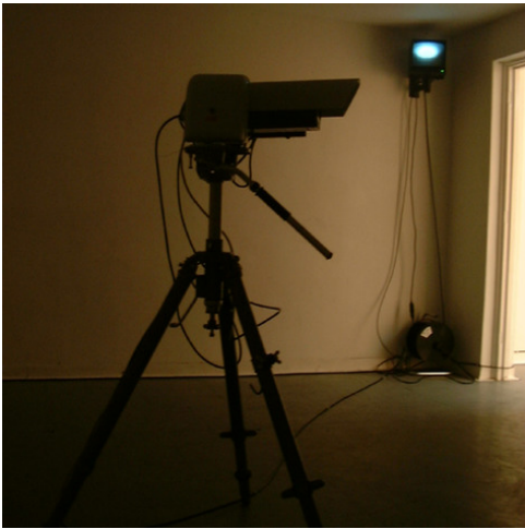
Motorised Surveillance Camera Credit: David Cotterrell (2001)

High Fidelity was an exhibition by three international artists working within new media and kinetic installation.