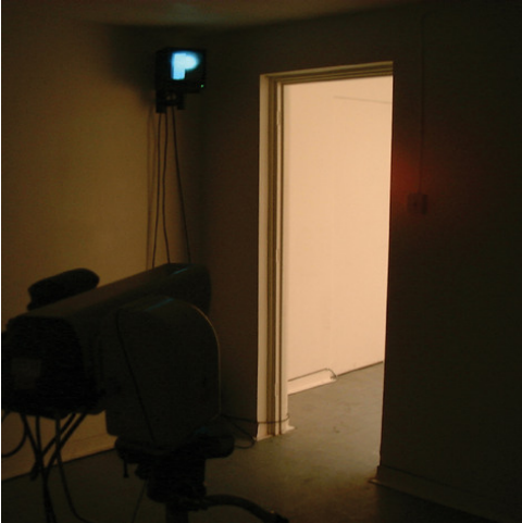
Detecting visitors