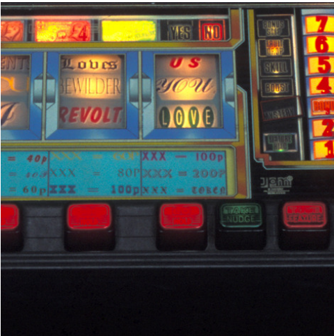
A 'no-win' line Credit: David Cotterrell (1997)