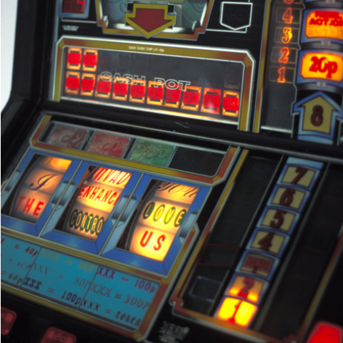
Modified Fruit Machine Credit: David Cotterrell (1997)