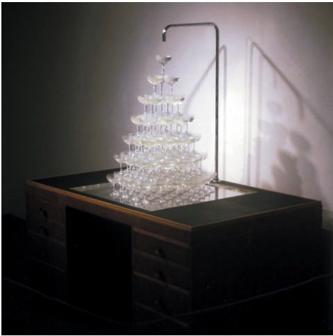
Glass Towers installed at the Paton Gallery Credit: David Cotterrell (1997)

Exhibition of four artists selected by the Paton Gallery from the final MA exhibitions at Chelsea College of Art.