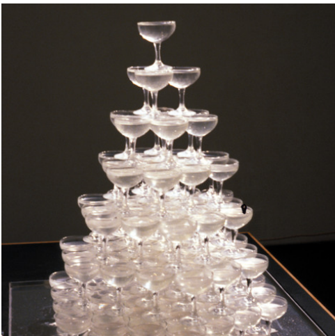
A simple closed system Credit: David Cotterrell (1997)