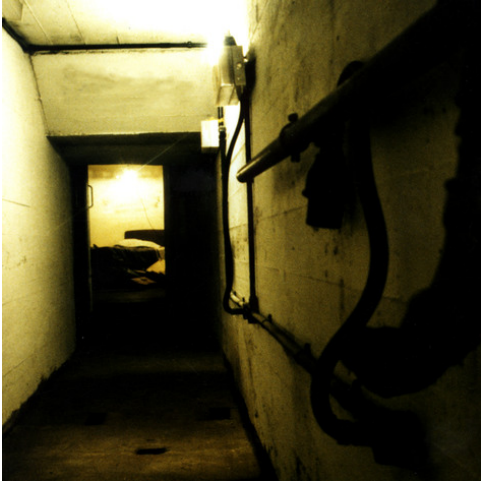
Entrance to Bunker