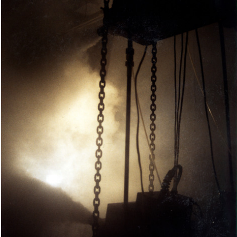
Liquid CO 2 projection surface