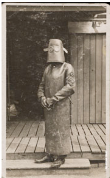
WWI, France: A radiographer wearing protective gear