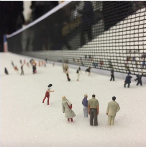
Installation at Ambika P3 Gallery