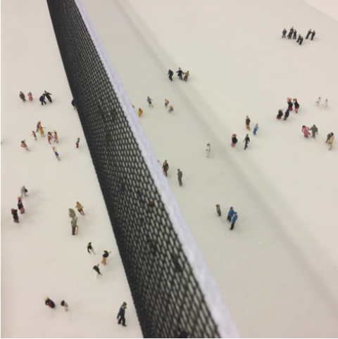
Installation at Ambika P3 Gallery