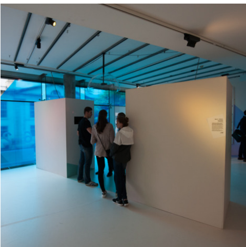
Installation View Credit: David Cotterrell (2016)