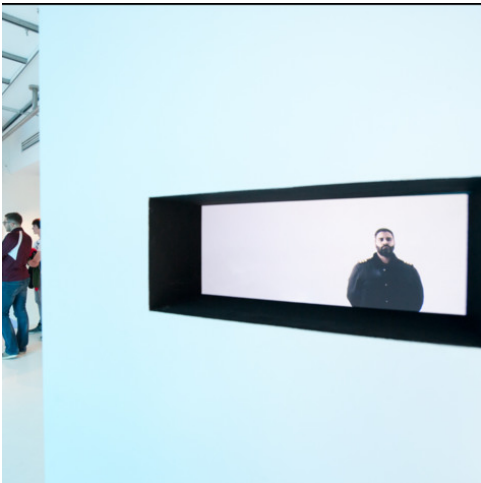
Installation View (Detail) Credit: David Cotterrell (2016)