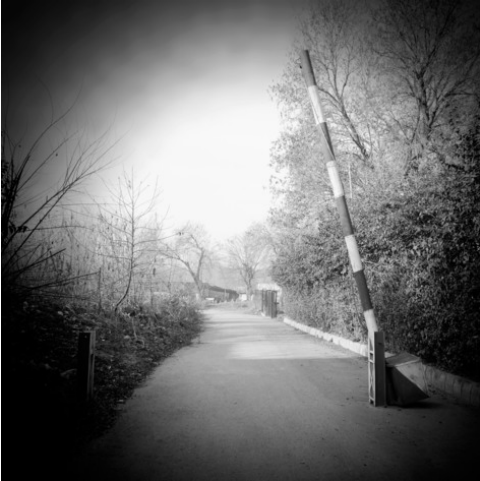
Diplomatic Enclave, Islamabad