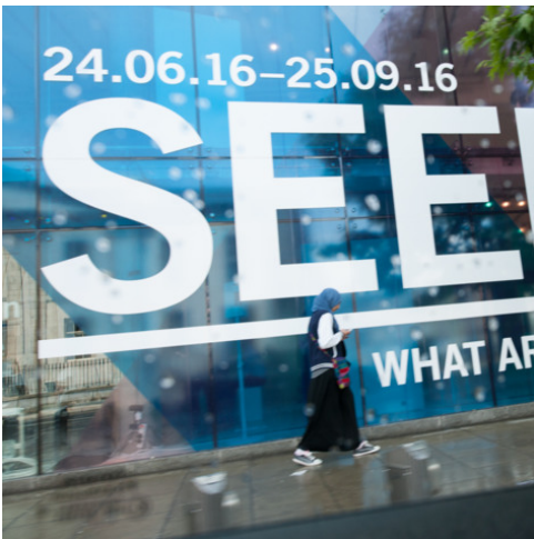
Science Gallery (2016)