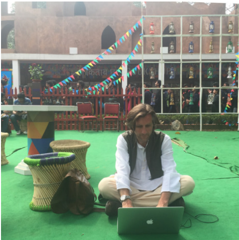
Preparing Presentation (2016)