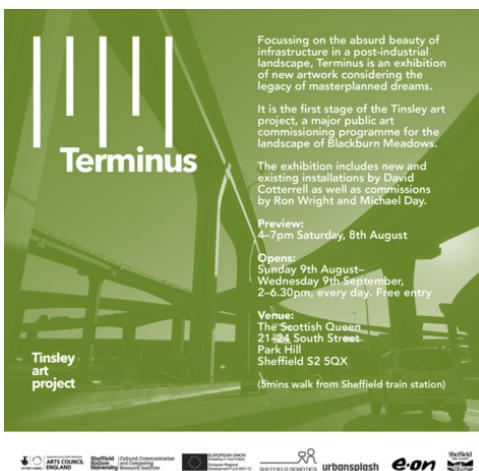
Exhibition Invite Credit: Eleven Design (2015)

For more information and images please email: andrew.skelton@sheffield.gov.uk or telephone: +44(0)114 205 3784