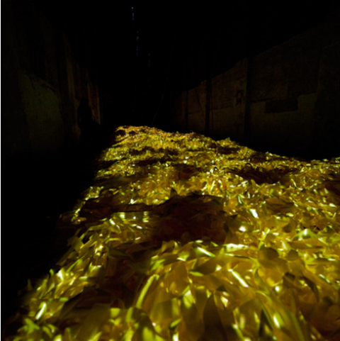
Installation View Credit: David Cotterrell (2011)