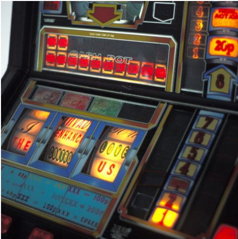
Modified Fruit Machine Credit: David Cotterrell (1997)